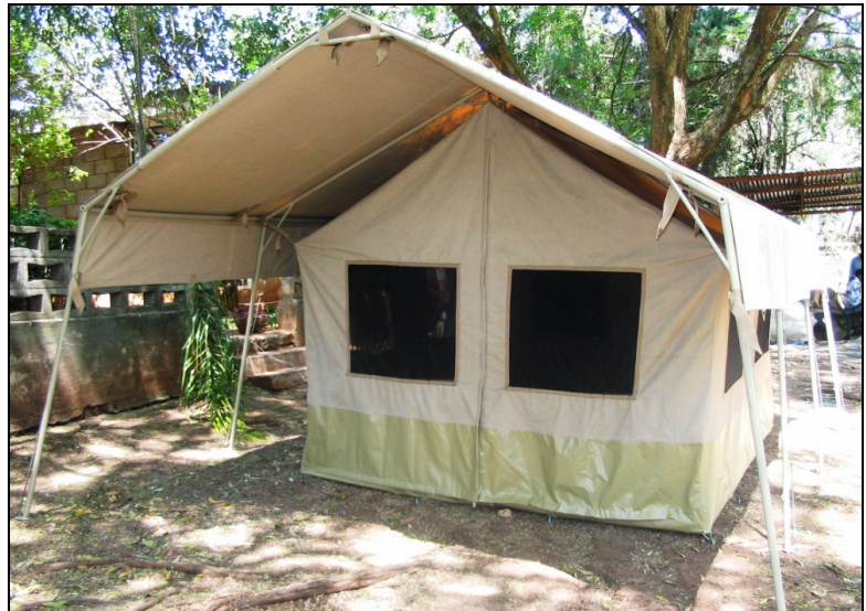
“The AFEX Special”

The AFEX Special, available in either beige or army green, offers generous proportions, large inspect-proof windows with well-designed zip-up flaps, high PVC lower side wall to ensure proper water resistance, a spacious front verandah, large top quality